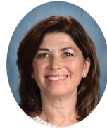
Micha Moore Bailey Early Childhood Center