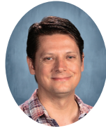
John Coakley Davis Middle School