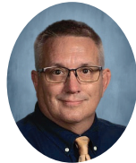
Warren Miller Horizon Alternative School